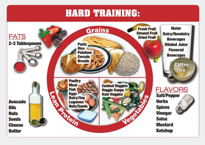
Figure 1. The Athlete's Plate nutrition education tool

Developed by Meyer NL with University of Colorado Colorado Springs' (UCCS) Sport Nutrition Graduate Program in collaboration with the US Olympic Committee's (USOC) Food and Nutrition Services. Reproduced with permission.