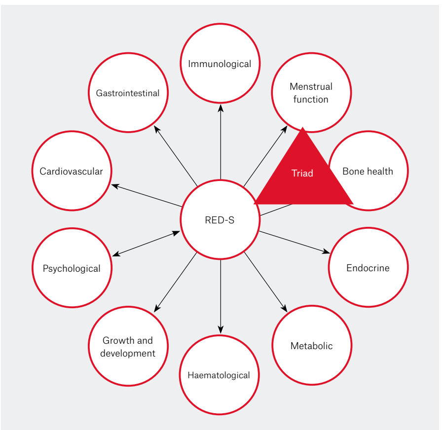
Figure 2. Health consequences of relative energy deficiency in sport (RED-S). 'Triad' refers to the female athlete triad.17

Performance-based supplements (Category A) include caffeine, bicarbonate, beta-alanine, nitrate, creatine and glycerol; however, their value is specific to particular event characteristics (eg repeated sprint ability). Supplement considerations may also extend to athletes undertaking travel or competing in challenging environments (eg heat and altitude), and individuals with restricted dietary choice (eg vegetarians). Ideally, each athlete should develop a personalised, periodised, and practical nutrition plan - via collaboration with their coach and accredited sports nutrition expert - to optimise their performance. The Sports Dietitian Australia website is useful to locate the nearest sports dietitian,